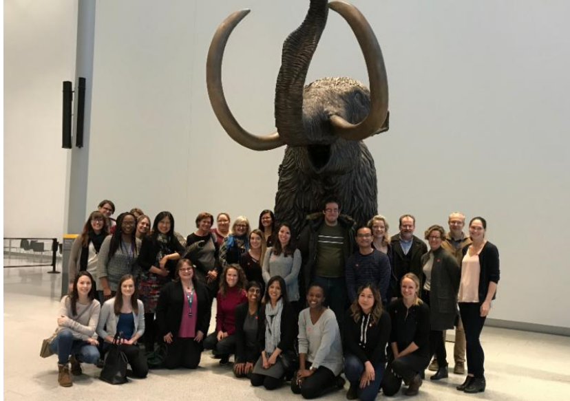
The PolicyWise team at the new Royal Alberta Museum (taking on yet another MAMMOTH task of a group photo!)