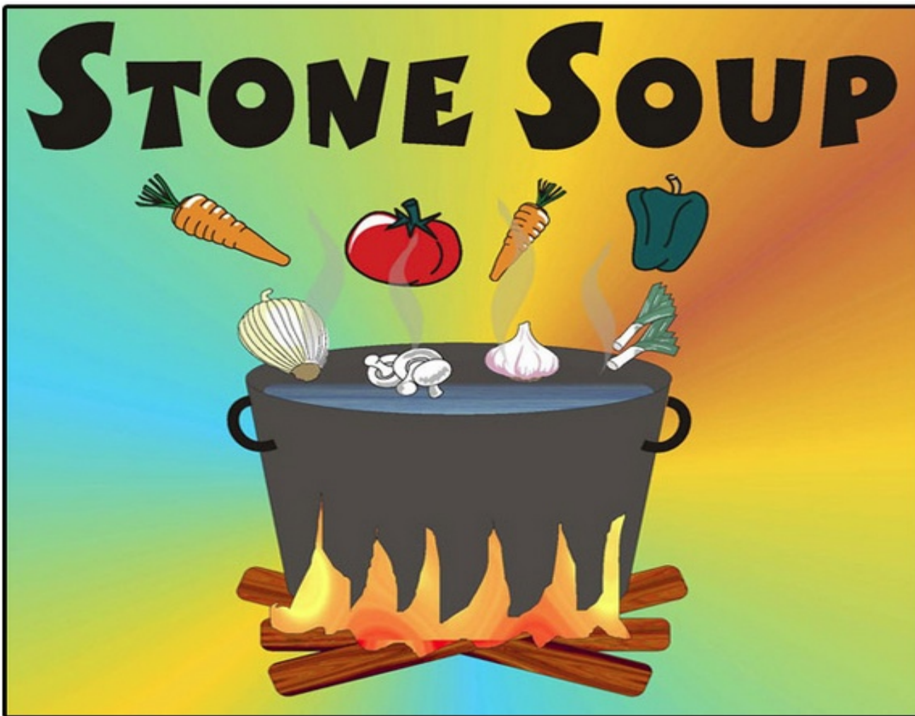
Image: Stone Soup